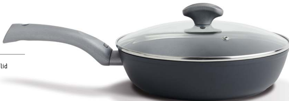
ø cm 26/10,5" Skillet + glass lid